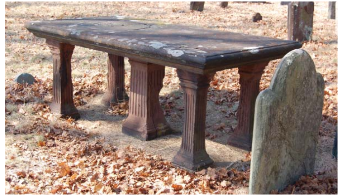
Figure 4. This sandstone table tomb, located in Cedar Grove Cemetery, New London, CT, is an engineered grave marker structure consisting of a horizontal stone tablet supported by four vertical table "legs" with and a central column,.

Grave markers can also be engineered structures. Examples of grave marker structures include masonry arches, box tombs, table tombs, grave shelters, and mausoleums (Fig. 4). The box tomb is a rectangular structure built over the gravesite. The human remains are not located in the box itself as some believe, but rather in the ground beneath the box structure. The table tomb is constructed of a horizontal stone tablet