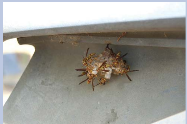
Figure D. Yellow jackets that are nesting below the projecting molding of this grave marker pose a hazard to visitors and staff because, if disturbed, they will vigorously defend their nest. Yellow jacket, paper wasp and hornet nests should be removed from grave markers by trained staff or specialists.

Snakes, wasps, and burrowing animals inhabit historic cemeteries (Fig. D). Snakes sun on warm stones and hide in holes and ledges, so it is important to be able to identify local venomous snakes. An appropriate venomous snake management plan should be in place, and