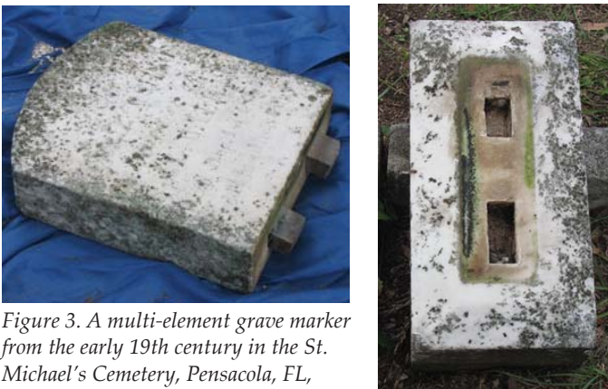
Figure 3. A multi-element grave marker from the early 19th century in the St. Michael's Cemetery, Pensacola, FL, consists of a vertical element with tabs (left image) into a slotted base (right image).

slot" grave marker, the tabbed upper stone was set in a slotted base. More common today, the upper headstone is secured with a technique that uses small spacers set on the base and a setting compound. This technique or one that uses an epoxy adhesive may be found on older markers where the stones have been reset.