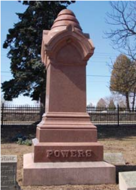
Figure 5. A variety of colors of natural stone are found in historic cemeteries, such as this pink granite marker in the Cedar Grove Cemetery, New London, CT.

the selection of materials and procedures for its cleaning and protection.