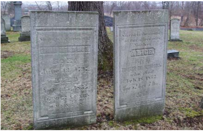
Figure 2. These mid-19th century, single-element stone grave markers in the Grove Cemetery in Bath, NY, are set in a vertical position.

slot" grave marker, the tabbed upper stone was set in a slotted base. More common today, the upper headstone is secured with a technique that uses small spacers set on the base and a setting compound. This technique or one that uses an epoxy adhesive may be found on older markers where the stones have been reset.