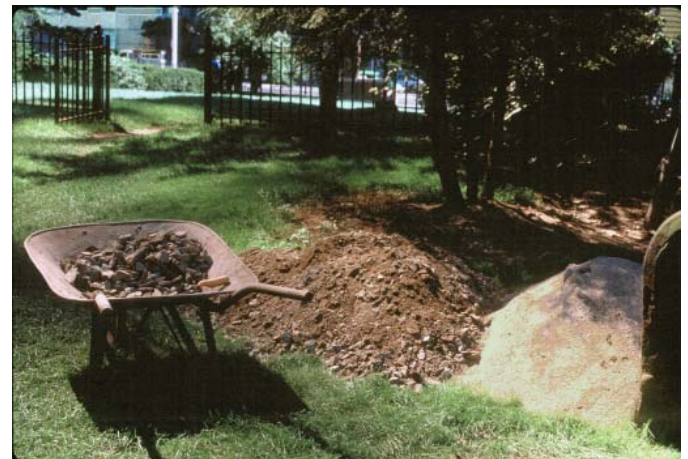
Figure 20b. To facilitate drainage, crushed stone, gravel, and sharp sand line the hole and are hand-tamped around the stone after placement.