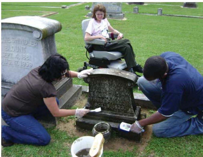
Figure 17. Volunteers can undertake cleaning of grave markers once they have received initial training. Cleaning methods may include wetting the stone, using a mild chemical cleaner, gently agitating the surface with a soft bristle brush, and thoroughly rinsing the marker with clean water.

General maintenance may involve low-pressure water washing. In most cases, surface soiling can be removed with a garden hose using municipal water or domestic