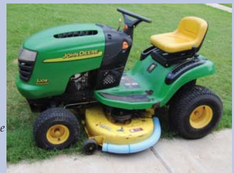
Figure B. A pool ‘noodle’ can be fitted to the deck of a lawnmower to prevent damage to grave markers.

Ongoing maintenance of cemetery vegetation is essential to conserve grave markers and fencing. Periodic inspections may warrant removing trees; trimming tree limbs, shrubs, and vines; and removing volunteer vegetation. All trees should be inspected at least every five years. Annual inspections are necessary to assess the condition of shrubs and vines, and to identify volunteer growth for removal. Mowing and trimming around the hundreds of stone, brick, iron, and wood features found in many cemeteries is a weekly or bi-weekly chore. Lawn care is the most time-consuming, and, if not done carefully, potentially destructive maintenance activity in historic cemeteries.