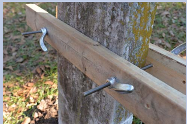
Figure E2. The clamp system is constructed from off-the-shelf wooden boards.

lifting techniques. Lift equipment and ergonomically correct tools should be routinely used to lift heavy markers (for most people this includes markers that weight more than 50 pounds). For smaller grave markers, a simple wooden clamp system can be constructed for a two-person lift (Figs. E1 and E2).