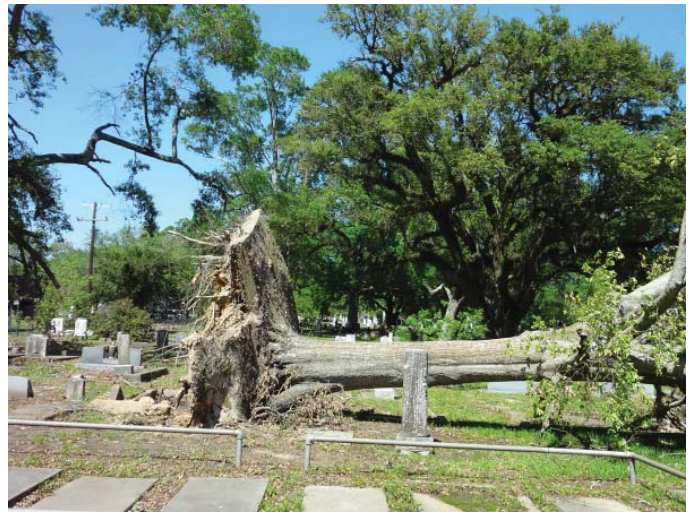
Figure 11. Woody vegetation can damage grave markers and pose a risk to visitors unless well managed and maintained.

Aside from vandalism and purposeful neglect, most risk factors attributable to human activity are unintentional. Sometimes damage to grave markers is the result of cleaning or repair done with the best of intentions. These unfortunate mistakes can be the result of insufficient training and funding, misuse of tools and equipment, and poor planning. With proper training and supervision, human risk factors can be lessened.