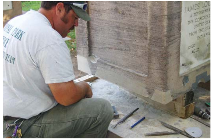
Figure 16. A professional mason works to insert a new piece of stone. Often referred to as a “dutchman”, this repair technique requires replacing the deteriorated stone section with a new finished piece of the same size and material.

The cemetery manager can use the information from the condition assessment report to develop a maintenance plan with a list of cyclical maintenance work. Many tasks can be carried out by in-house staff. For example, maintenance cleaning of metal and stonework can often be accomplished by rinsing with a garden hose. Applications of wax coatings can be used to protect bronze elements. Trained staff can undertake these tasks. Teaching graffiti removal techniques to cemetery staff may also be necessary if vandalism is an on-going problem. Staff should have access to written procedures