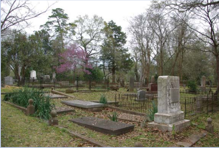
Figure A. Cemeteries are cultural landscapes made up of a variety of features. Grave markers are but one component of cemeteries that also include walkways, drives, fences, coping, trees, shrubs, and other vegetation. Each component adds to the understanding of the cemetery landscape.