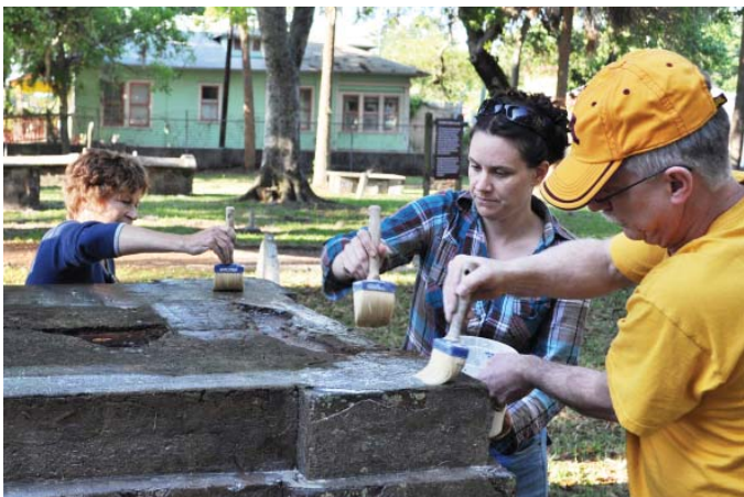
Figure 23. Limewash is a breathable coating sometimes used to protect the surface of the grave marker and provide a decorative finish. Limewash is applied by brush in five to eight thin coats (with each coat about the consistency of skim milk). The surface is allowed to slowly dry between coats. Sometimes the surface is covered by damp burlap to slow the drying process.

Limewash is a traditional coating that brightens stucco-covered grave markers (Fig. 23). Like paint coatings, it needs to be periodically applied. Limewash is prepared with lime putty or hydrated lime and water. Curing begins following application. The lime putty or hydrated lime reacts with carbon dioxide in the air in a process called carbonation. This reaction eventually forms calcium carbonate, a stable hard coating. Limewash is a “green” coating with no volatile organic compound content and is “breathable,” i.e., it allows for water vapor transmission. Although commonly white, limewash can be colored or tinted with alkali-stable pigments such as iron oxide.