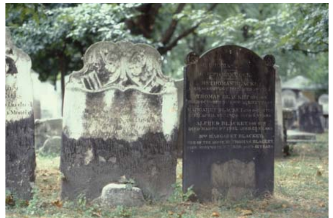
Figure 9. The limestone and sandstone grave markers in this historic cemetery have different weathering processes. On the left, the limestone shows surface loss in areas exposed to rainwater and gypsum crust formation below. The sandstone marker on the right displays uniform soiling, but surface hardening may be occurring.

All grave marker materials deteriorate when they are exposed to weathering such as sunlight, wind, rain, high and low temperatures, and atmospheric pollutants (Fig. 9). If a marker is composed of several materials, each may have a different weathering rate. Some weathering processes occur very quickly, and others gradually affect the condition of materials. Weathering results in deterioration in a variety of ways. For example, when exposed to rainwater some stones lose surface material while others form harder outer crusts that may detach from the surface.