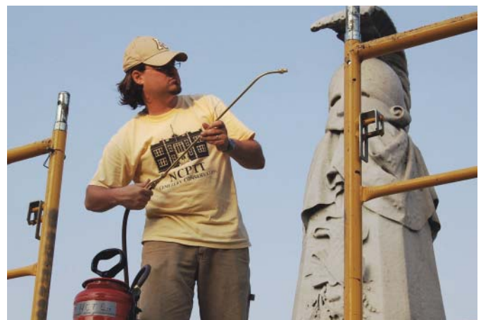
Figure 24. A severely deteriorating monument or grave marker can be treated with a stone consolidant. The treatment is usually applied using a spray system. The consolidant soaks into the stone and replaces mineral binders that hold the stone together. On-site and laboratory testing and evaluation are performed prior to using this non-reversible type of treatment.

When erosion is severe, consolidation treatments (e.g., ethyl silicate) have been used to replace mineral binders lost to weathering (Fig. 24). Because these treatments are not reversible, laboratory and on-site testing are essential. Application by a conservator or other experienced preservation professional is advised.