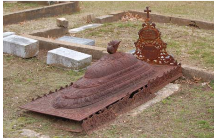
Figure 6. Decorative cast-iron grave markers like this late-19th century one in Oakland Cemetery in Shreveport, LA, are produced by heating the iron alloy and casting the liquid metal into a mold.

Metals are solid materials that are typically hard, malleable, fusible, ductile, and often shiny when new (Fig. 6). A metal alloy is a mixture or solid solution of two or more metals. Metals are easily worked and can be melted or fused, hammered into thin sheets, or drawn into wires. Different metals have varying physical