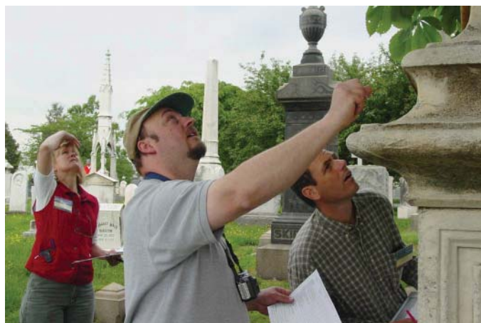
Figure 15a. Condition surveys are undertaken to document current conditions, determine safety issues, and plan both emergency stabilization and future treatment plans. There are a variety of survey forms available that can be tailored to the specific cemetery.

Condition assessments help identify potential safety hazards, required preservation work, and any additional conservation that is needed for stabilization and protection of grave markers. Assessments also provide important baseline information about deterioration affecting grave markers. The collected information is helpful in determining and prioritizing maintenance tasks, identifying unstable conditions that pose an immediate threat, and for developing a plan for any needed repair or conservation work. Assessments should be recurring, preferably every spring. Condition assessments also help determine the extent and severity of damage following a disaster.