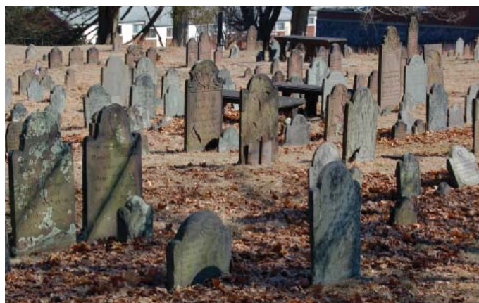
Figure 1. Sandstone and slate grave markers in the Ancient Burying Ground in New London, CT, display a variety of weathering conditions. Markers in the cemetery date from the mid-17th to the early 19th centuries.

This Preservation Brief focuses on a single aspect of historic cemetery preservation—providing guidance for owners, property managers, administrators, in-house maintenance staff, volunteers, and others who