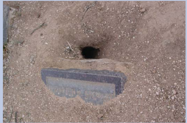
Figure C. Gophers and other burrowing animals produce uneven ground and holes that are trip and falling hazards to visitors and staff of historic cemeteries.

Trip and falling hazards include uneven ground, holes, open graves, toppled grave markers, fallen tree limbs, and other debris (Fig. C). Sitting, climbing, or standing on a grave marker should be avoided since the additional weight may cause