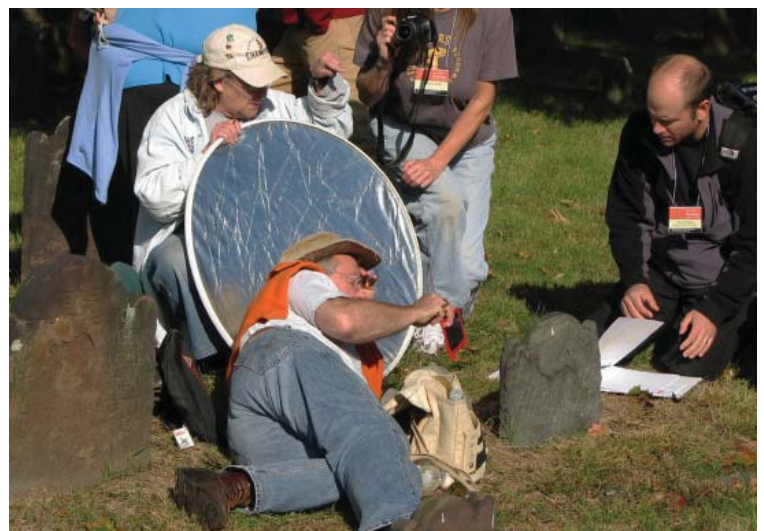
Figure 15b. Photographs are used to document the condition of the grave marker as part of a condition assessment.

A tool kit for the condition assessment may include binoculars, digital camera, magnifying glass, measuring tape, clipboard, carpenter's rule, level, magnet, and flashlight. For large monuments, a ladder or aerial lift may be required. Photographs of each marker, including overall shots and close-up details, are an essential part of the documentation process. Photo logs are helpful for