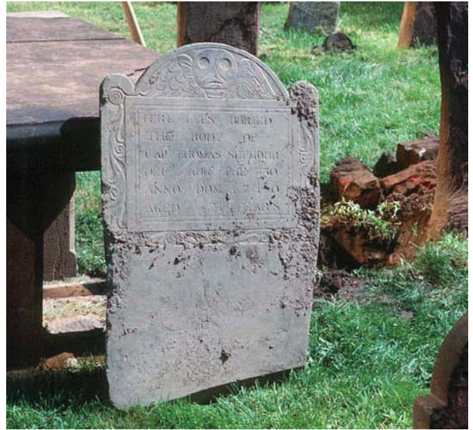
Figure 20a. This slate grave marker in the Ancient Burying Ground in Hartford, CT, is a ground-support stone. Resetting requires digging a hole that will hold the base of the stone and then compacting the soil at the bottom of the hole by hand.

Inexperienced staff or volunteers should not attempt resetting without training from a conservator, engineer, or other preservation professional. When dealing with fragile or significant grave markers, or those with large