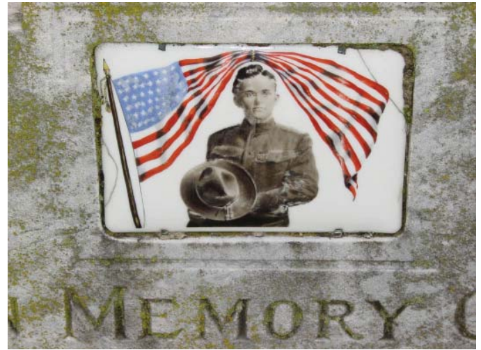
Figure 8. A fired ceramic, this cameo is set in a marble grave marker, located in Elmwood Cemetery, Memphis, TN. Different materials may require different conservation approaches.

Old cemeteries often include a wide variety of other materials not normally associated with contemporary grave markers, such as ceramics, stained glass, shells, and plastics (Fig. 8). As with masonry, metals, and wood, each has its own chemical and physical properties which affect durability and weathering. These materials