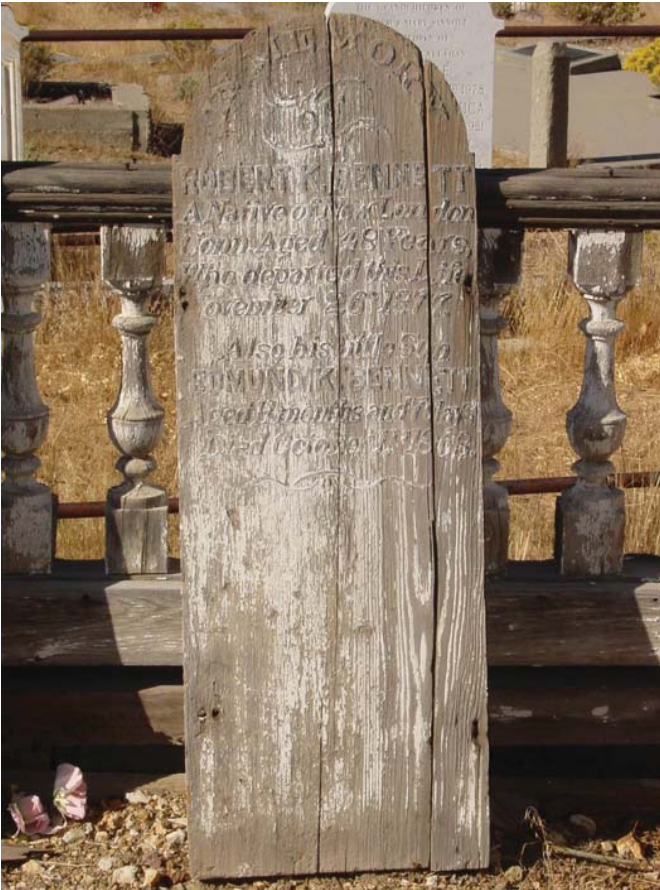
Figure 7. As shown by this 1877 marker in Silver Terrace Cemetery, Virginia City, NV, exposure to sunlight can damage wood grave markers, making the wood more susceptible to water damage and cracking.

appearance and influence wood properties. Wood-cell walls and cavities contain moisture. Oven drying reduces the moisture content of wood. After the drying process, the wood continues to expand and contract with changes in moisture content. The loss of water from cell walls causes wood to shrink, sometimes distorting its original shape (Fig. 7).