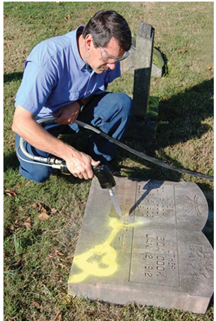
Figure 18. Graffiti is carefully removed using a low-pressure dry-ice misting instrument.

If the graffiti is water soluble, it can be removed using water and a soft cloth or towel. Rinsing the cloth frequently helps to avoid smearing graffiti on unaffected areas. If the graffiti is not water soluble, organic solvents or commercial graffiti removal products suitable for the grave marker material are recommended. Products should be tested prior to use. General cleaning of the entire marker is a good follow-up for a more even appearance. For deep-seated graffiti, poultice cleaning (previously described) may be required to extract staining materials.