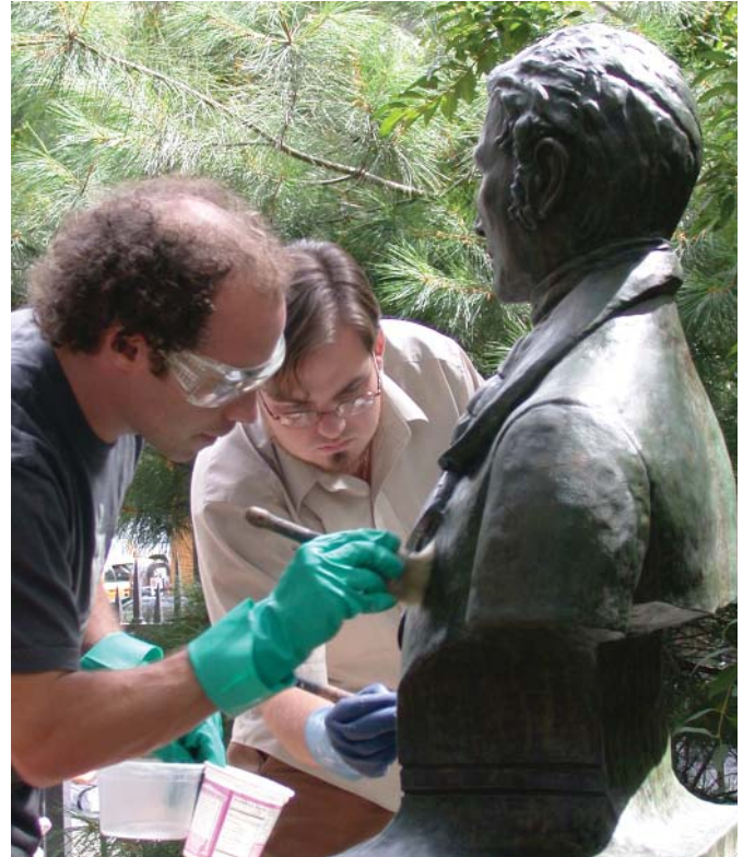
Figure 22. A protective coating must be maintained on metal elements. Wax or lacquer coatings help preserve the bronze patina and slow corrosion. Conservators apply a microcrystalline wax to this bust at St. Mark's Church in-the-Bowery, New York, NY.

Wax coatings are often used for bronze markers (Fig. 22). Wax provides a protective barrier against moisture, soiling, and graffiti. There are several steps in the wax application process. Where there is little corrosion, gentle cleaning of the marker is undertaken prior to applying the wax coating. Apply a thin layer of wax to the marker using a stencil brush or chip brush. Mineral spirits can be added to the wax to facilitate