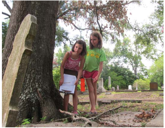
Figure 25. Involving the community in activities helps to develop an appreciation for the cemetery and serves to deter vandalism. Events may include children through school or scouting organizations and can help teach across the curriculum.

Maintenance is the key to extending the life of historic cemetery grave markers. From ensuring that markers are not damaged by mowing equipment and excessive lawn watering, to proper cleaning and resetting, good cemetery maintenance is the key to extending the life of grave markers. Whether rescuing a long-neglected small cemetery using volunteers or operating a large active cemetery with paid staff, the cemetery's documentation, maintenance and treatment plans should include periodic inspections. Only appropriate repair materials and techniques that do not damage historic markers should be used and records should be kept on specific repair materials used on individual grave markers. A well-maintained cemetery provides an attractive setting that can be appreciated by visitors, serves as a deterrent to vandalism, and provides a respectful place for the dead. A community history recorded in stone, wood and metal markers, cemeteries are an important part of our heritage, and are deserving of preservation efforts (Fig. 25).