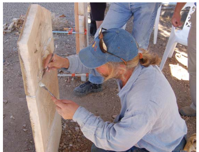
Figure 21. Cracks in a stone marker should be filled to keep water and debris out and prevent the crack from becoming larger. A patching mortar is designed to be used, in this case, with historic marble.

Hairline masonry cracks may be the result of natural weathering and require no immediate treatment except to be photographed and recorded. However, larger cracks often merit further attention. Repairing masonry cracks involves several steps and typically a skilled hand (Fig. 21). The repair begins with the removal of loose material and cleaning. Materials that are used for crack repair include grouts for small cracks and epoxy for large cracks affecting the structural integrity of the monument. Gravity or pressure injection is used to apply grout or epoxy. Crack repair can be messy, so careful planning and experience are helpful. If the crack is active, a change in size of the crack will be noted over time. Active cracks require further investigation to ascertain the cause of the changes, such as differential settlement, and to correct, if possible, the cause prior to repairing the crack.