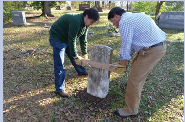
Figure E1. The simple wooden clamp system allows two people to safely lift a marble grave marker.

Proper work practices and lifting techniques need to be used whenever lifting or resetting grave markers. Many markers are surprisingly heavy. For example, a common upright marble headstone measuring 42" long, 13" wide, and 4" deep weighs over 200 pounds. Volunteers and workers should work in pairs, be able bodied, and have training in safe