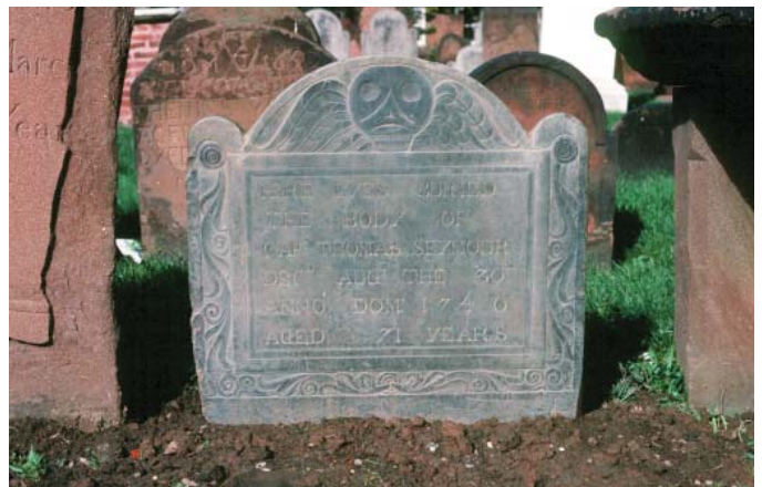
Figure 20c. The reset ground-supported grave marker should be level and plumb.